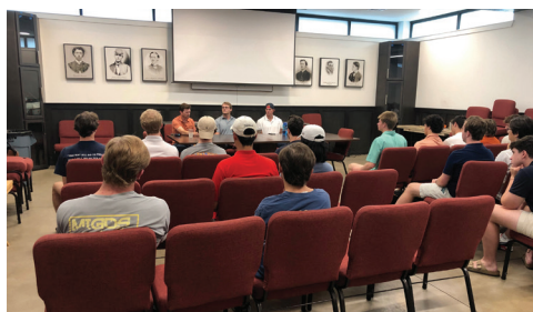
Alumni host at least one career advisory session per semester for undergraduate Pikes. Here, three younger alumni, all in the technology space, spoke in September 2021 in the Chapter Room to Pikes about computer science, engineering and marketing opportunities with their employers including Facebook and Oracle.