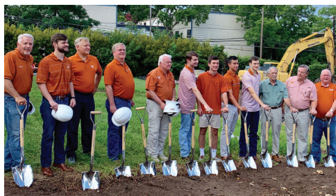
Board members of the Beta Mu Building Co. and then-chapter officers at the Pike House groundbreaking in June 2019. The new 22,500 square foot house was delivered ahead of time and under budget in July 2020.