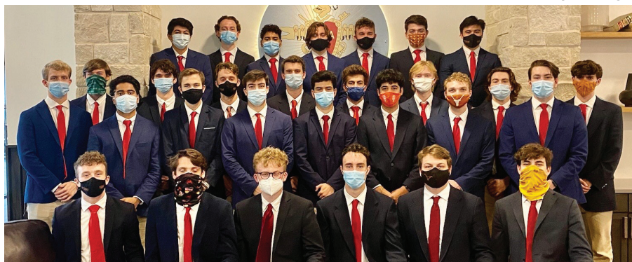
Beta Mu is excited to welcome the 33 young men from our centennial pledge class!

Fairfield, Conn. Ludlow High School Class Treasurer, A Cappella Neuroscience