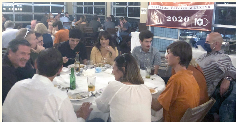
Friday night's dinner.

Pike traditionally hosts a fall Parents Weekend. On October 2, parents enjoyed dinner with their sons at Abel's on the Lake, and on Saturday a small game-watching party and brunch took place in the new chapter house. A good time was had by all despite the gridiron loss to TCU. Pike will also host a Dad's Weekend in March and a Mom's Weekend in April 2021.