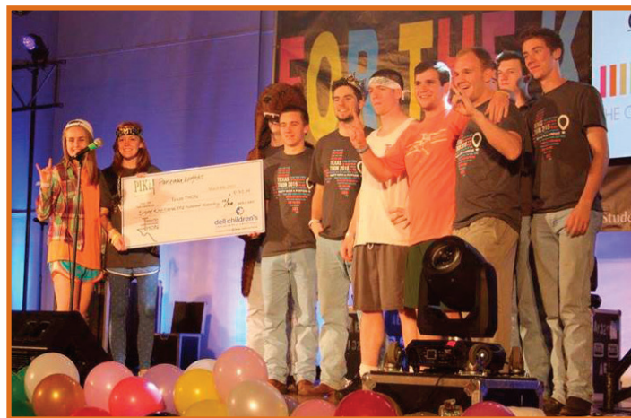
Pikes on stage were recognized as the number-one fundraising organization at the closing spring presentation party of Texas THON in February.