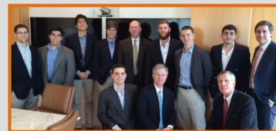
Pike alumni and undergraduates enjoyed lunch and a career session on the legal field January 6 at the Houston offices of Jones Day.