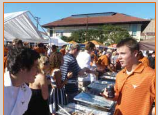
Parents and Pikes eating Texas barbecue at the tailgate near U.T.'s Blanton Museum of Art.