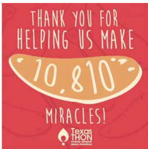
Graphic from the Pike pancake supper where Beta Mu raised $10,810 to benefit Dell Children's Hospital pediatric cancer research.